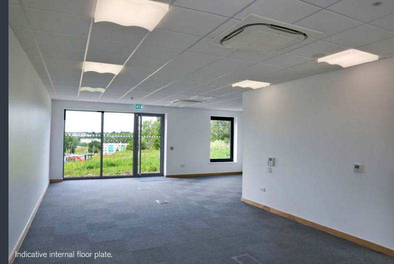
Indicative internal floor plate.

19 car parking spaces are provided in adjacent parking groves.